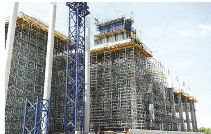
Werksman Head Office