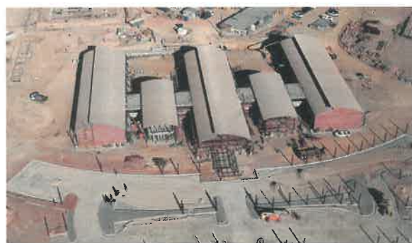
Kusile Power Station