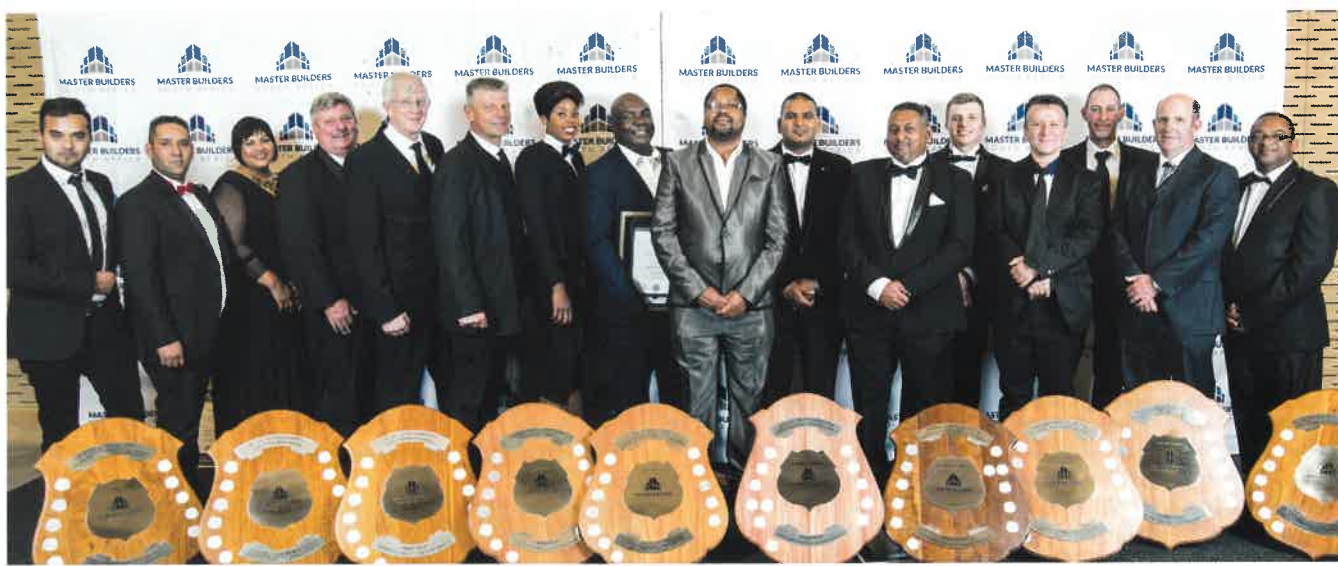
Winners of the Master Builders South Africa National Safety Competition - 2017