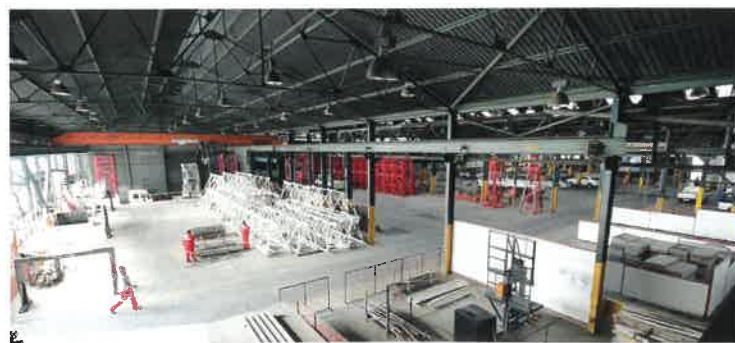
Tiber Village Deep Yard